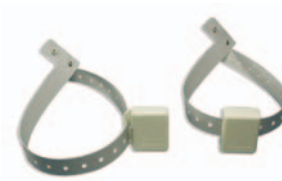
Lightweight, water-resistant tags ensure resident safety.