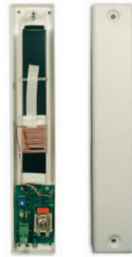
Transmit antennas monitor doors, hallways and elevators.

With Accutech's experience, quality and service, we can help you choose a wanderer security system that addresses these issues so you can continue to provide excellent resident care.