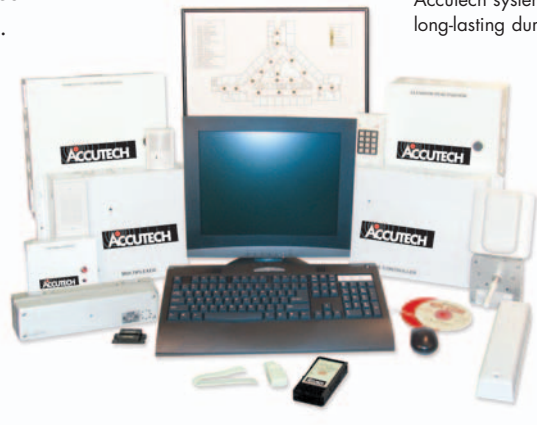
Accutech systems are built for long-lasting durability.